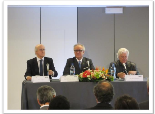
CEO of Imprensa Nacional-Casa da Moeda S.A., the Portuguese Ombudsman and the artist José de Guimarães

Associated to this anniversary the Imprensa Nacional-Casa da Moeda S.A., launched a commemorative coin entitled Ombudsman' 40 years by the artist José de Guimarães. The presentation took place at the Altis Hotel in Lisbon.