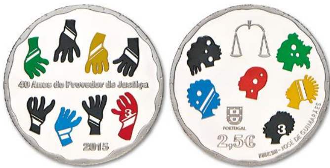
Silver version with proof special finishing First multicolor coin

December 9 th : The Portuguese Ombudsman celebrates the 40 th anniversary launching the Ombudsman 40 years commemorative coin .