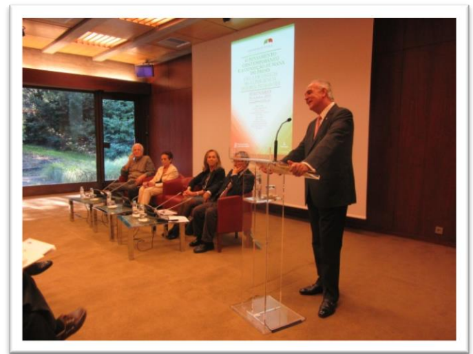
The Portuguese Ombudsman

October 14 th : The Portuguese Ombudsman has promoted the institutional seminar entitled The contemporary thought and the human condition of the prisoner (or) the hidden bad conscience of the well-thinking at the Calouste Gulbenkian Foundation in Lisbon.