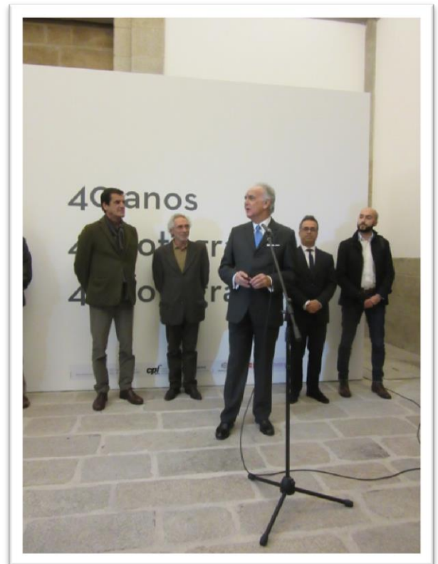
The Portuguese Ombudsman

November 21 st : The Portuguese Ombudsman promotes a photography exhibition entitled 40 years, 40 photos, 40 photographers as part of the 40 th anniversary celebrations and is aimed to foster awareness to its intervention and also to promote photography as an artistic expression.