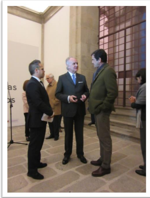
Director of the Portuguese Photography Centre, the Portuguese Ombudsman and the Oporto Mayor

1975 PORTUGUESE OMBUDSMAN 2015 40 YEARS WITH THE CITIZENS